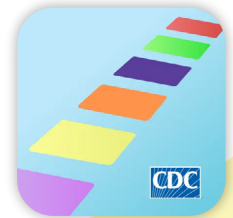
Milestone Tracker App