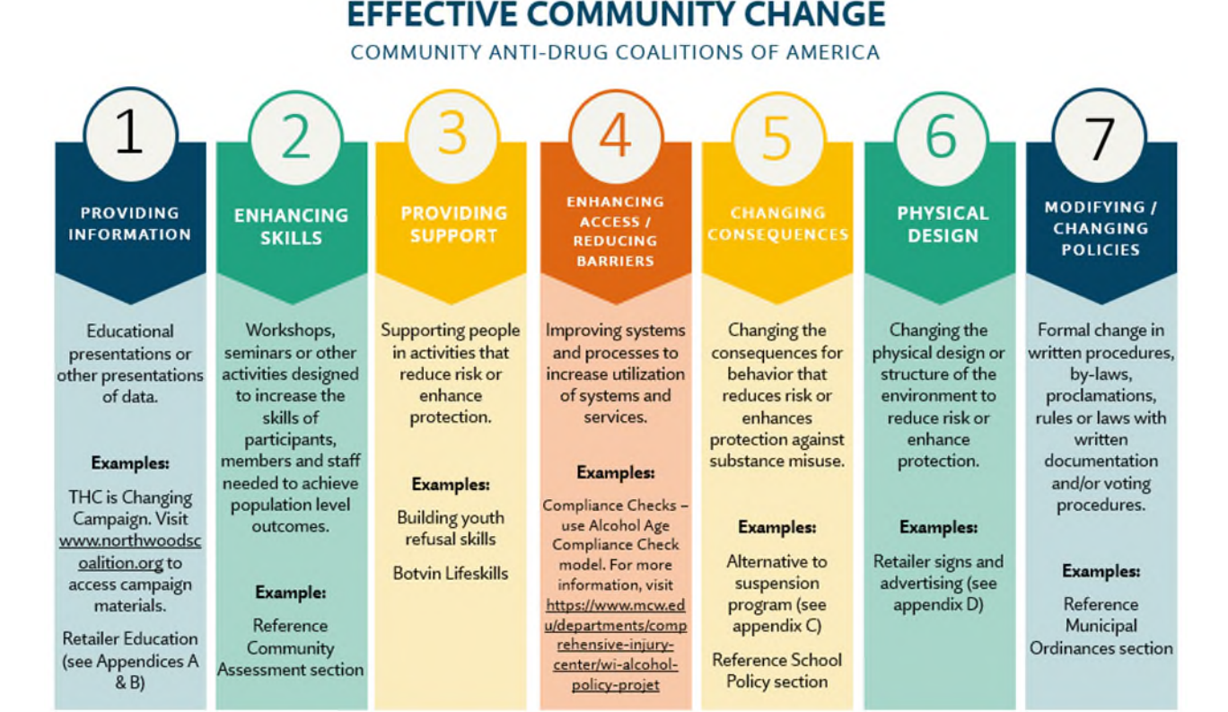
Figure 3: CADCA's Seven Strategies for Effective Community Change