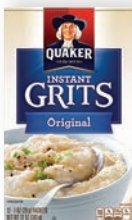
Original & all flavors in packets only