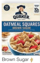
Brown Sugar ✂