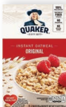
Plain: ✨ in packets only