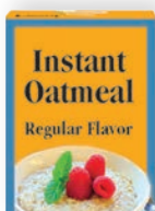
Plain: ✨ in packets only