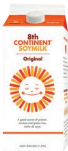
8th Continent: Original Only