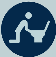
Xeev siab los sis ntuav