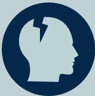
Mob taub hau