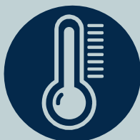
Kub ib ce ua npaws