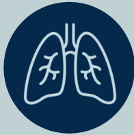
Ua pa nyuab