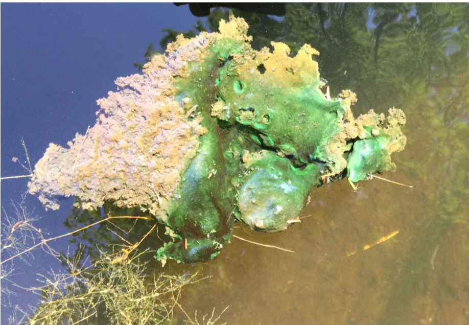
Has floating scum, globs, or mats