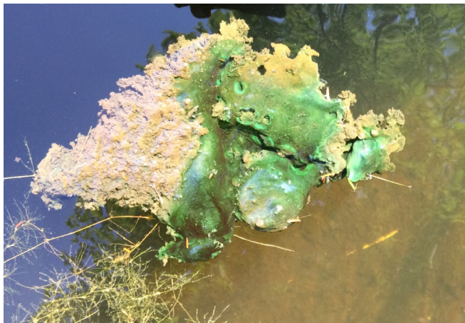
Has floating scum, globs, or mats