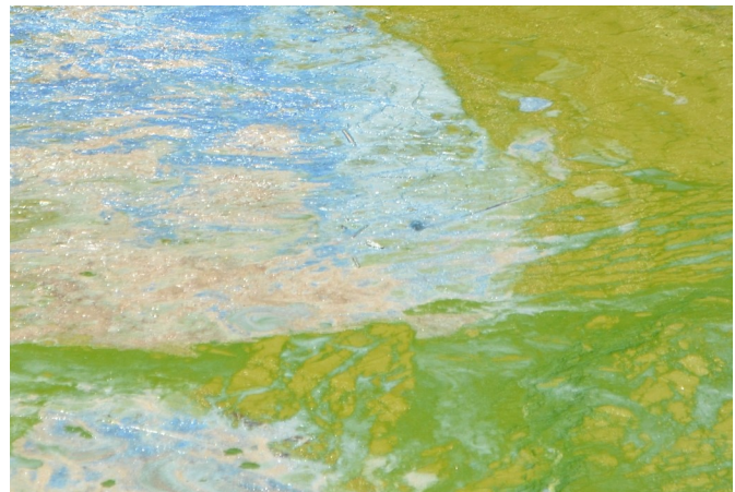
Looks like spilled paint or pea soup