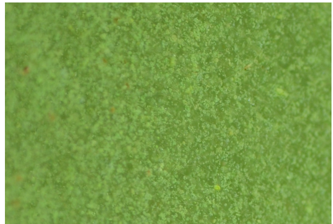
Has small green dots floating in it