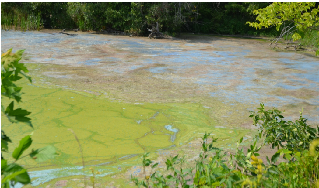
Surface scum that looks like spilled paint