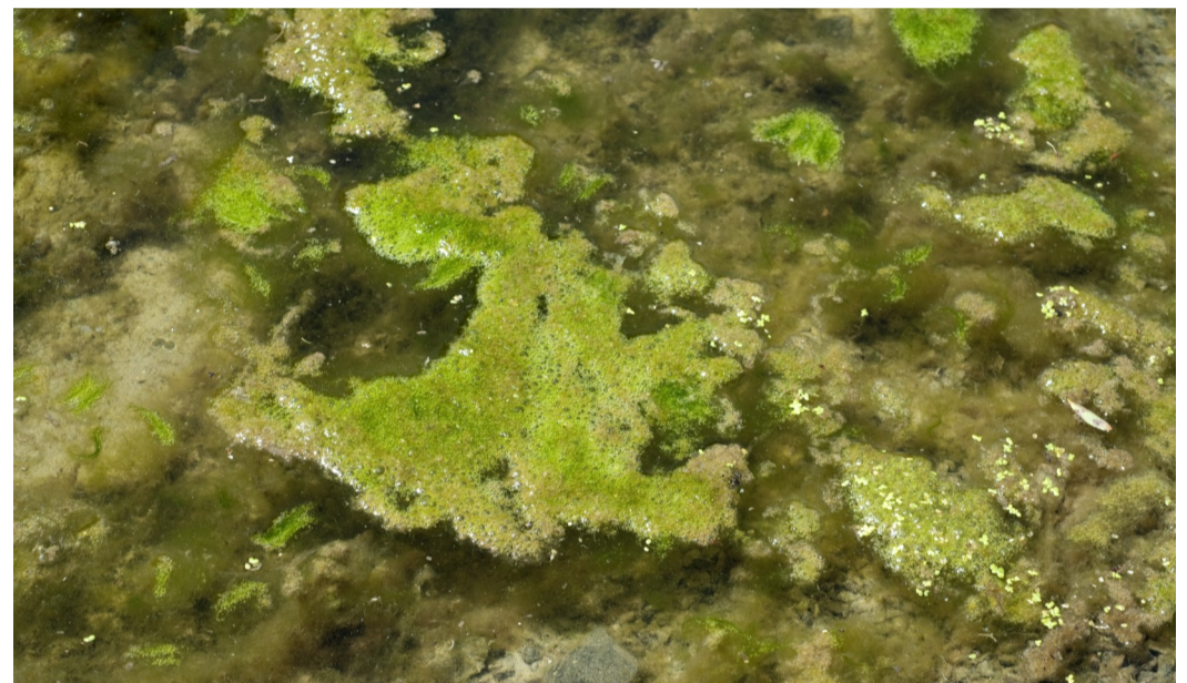
Long, hair-like filamentous green algae