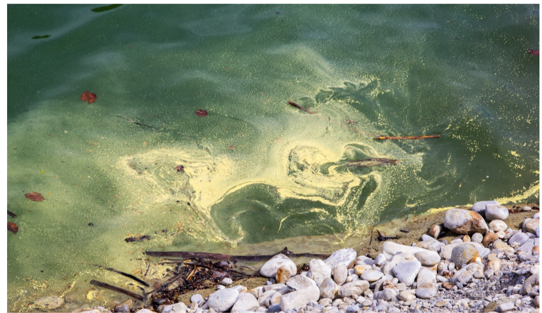
Yellow plant pollen