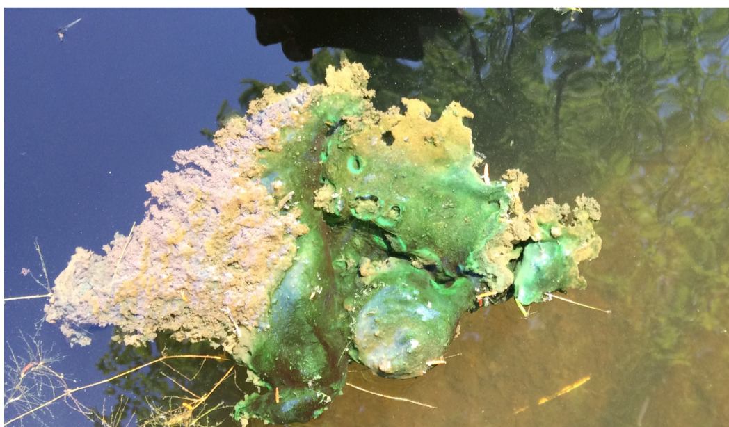
Floating globs or mats