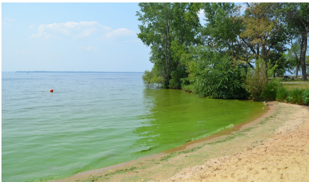
Green water that looks like pea soup