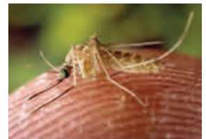
Species: Culex Diseases include: WNV