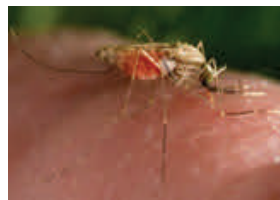
Species: Anopheles Diseases include: JC