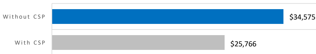
Average amount per consumer billed to Medicaid for emergency room and psychiatric inpatient services during first five years of enrollment