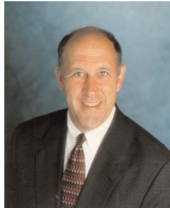
Governor Jim Doyle

SeniorCare can keep you or someone you know healthy.