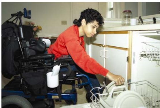
Person with physical disabilities living in a home environment.